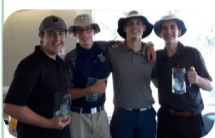
Spring Tourna- ment Winners