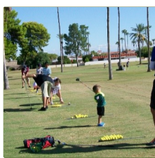
GPS Golf Academy Free Family Fun Day