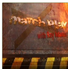
Watch GPS on Match Play w/ Ray Adams!