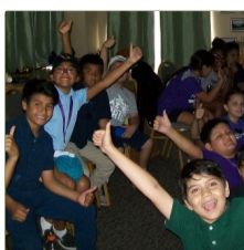
PH Gonzales Elementary- Enjoying the Golf Simulator